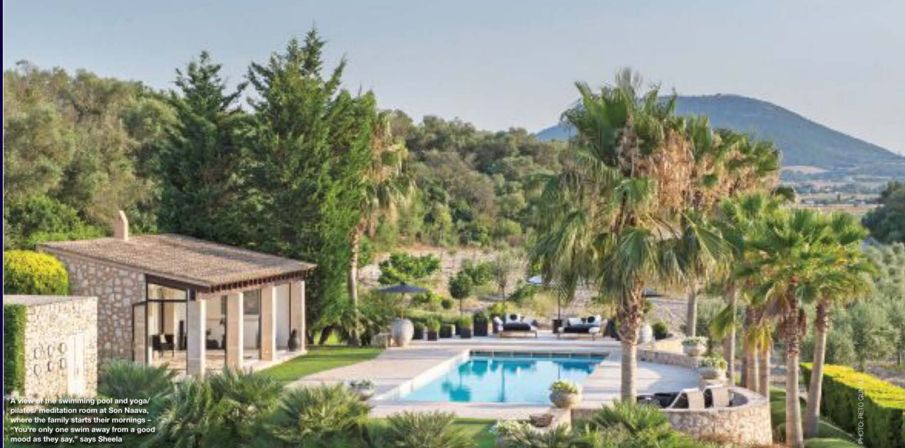
A view of the swimming pool and yoga/pilates/meditation room at Son Naava, where the family starts their mornings – “You’re only one swim away from a good mood as they say,” says Sheela