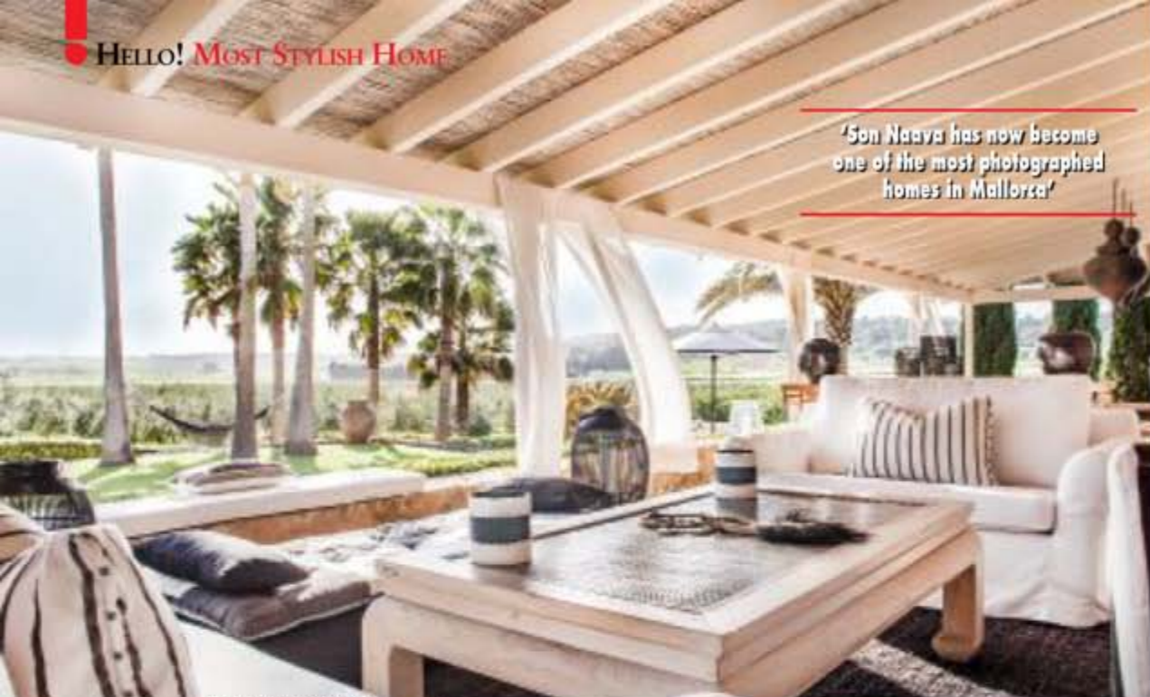
'Son Naava has now become one of the most photographed homes in Mallorca'