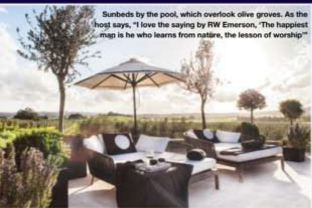
Sunbeds by the pool, which overlook olive groves. As the host says, "I love the saying by RW Emerson, 'The happiest man is he who learns from nature, the lesson of worship'"