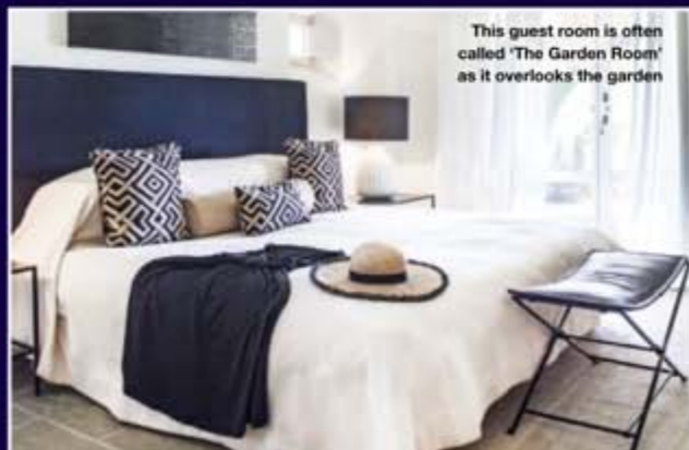
This guest room is often called 'The Garden Room' as it overlooks the garden